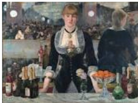
The Bar at the Folies-Bergere, 1882