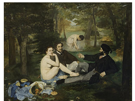
Luncheon on the Grass, 1863